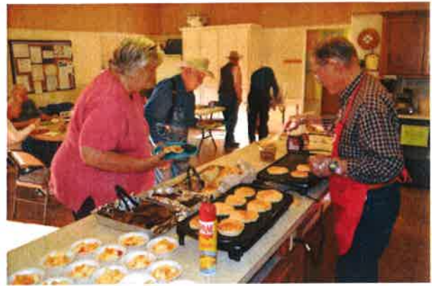
The Men serve at Monday's Kitchen