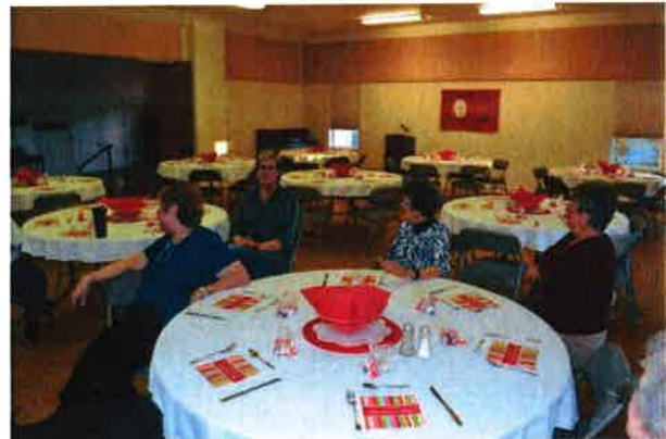
Folks working hard preparing for the LACare Banquet (above and below)